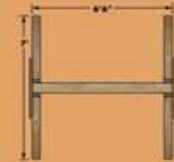
~2 Position Swing Set~ Comes with 1 Belt Swing & 1 Trapeze 7' deep x 6'6" wide x 8' tall