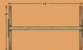
~4 Position Swing Set~ Comes with 2 Belt Swings, 1 Trapeze & 1 Glider 7' deep x 11' wide x 8' tall