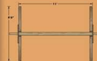
~Super Size Swing Set~ Comes with 2 Belt Swings & 1 Trapeze 3 position only 8'6" deep x 11' wide x 10' tall