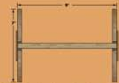
~3 Position Swing Set~ Comes with 2 Belt Swings & 1 Trapeze 7' deep x 9' wide x 8' tall